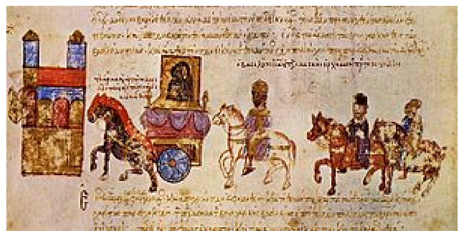
Figure 4: Emperor John 1 Tzimiskes entering Constantinople following an icon of the Virgin (Biblioteca National, Madrid)