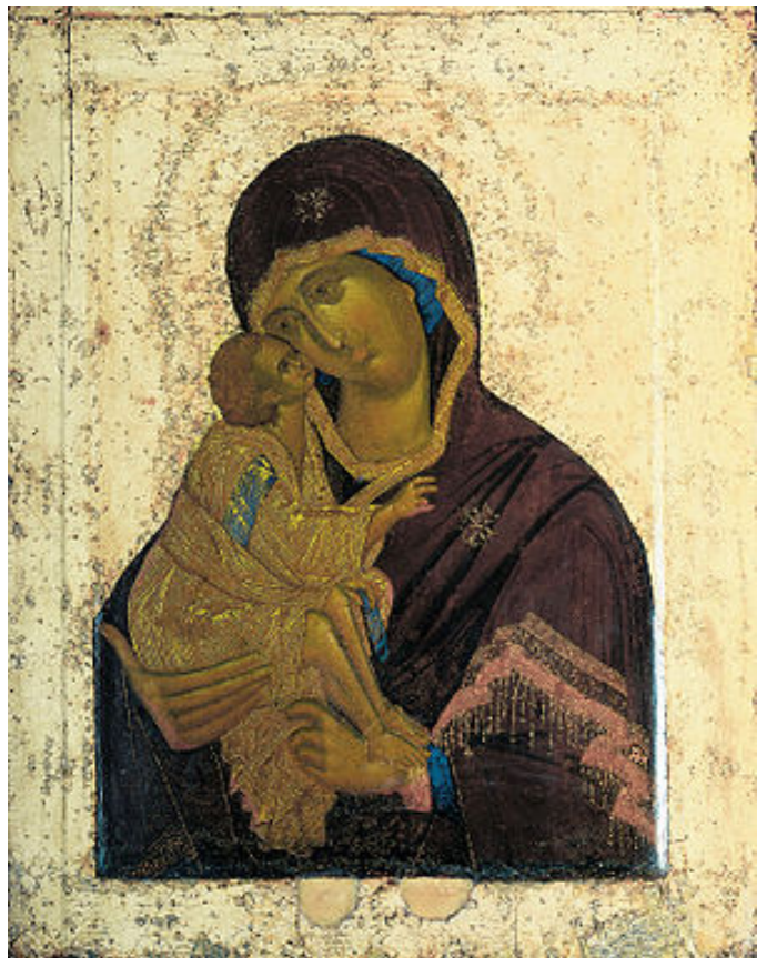
Figure 2. Virgin Eleousa known as Our Lady of the Don. 14<sup>th</sup> Century. Tretyakov Gallery, Moscou.