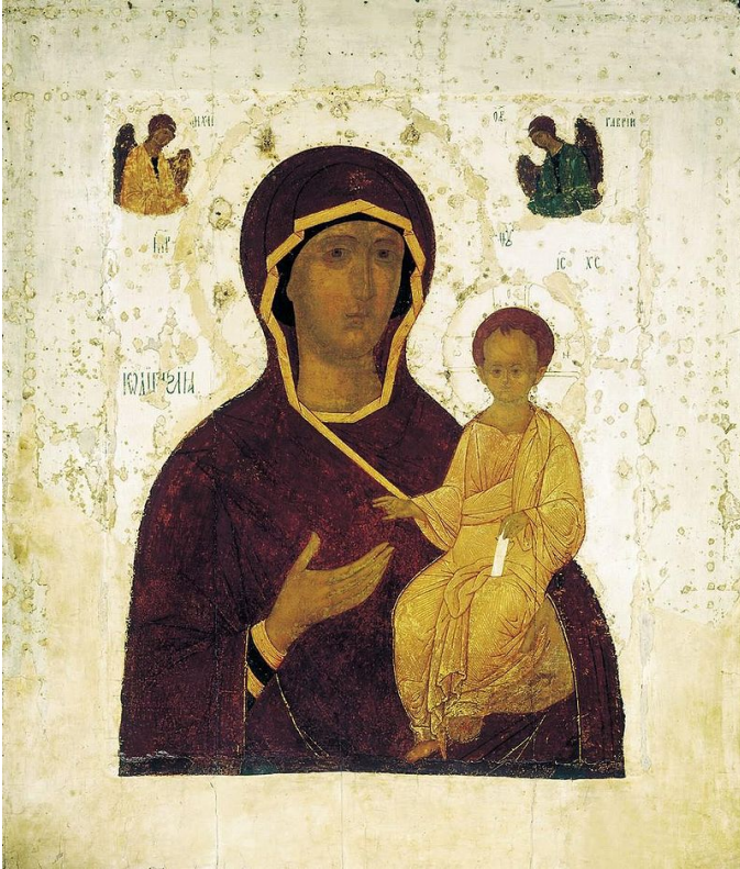
Figure 1. Virgin Hodegetria known as the Virgin of Smolensk.