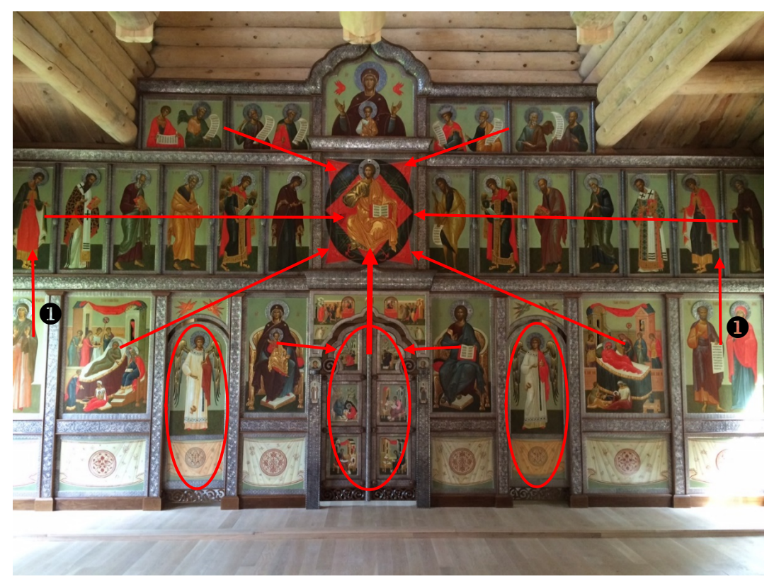
Figure 3: Iconostasis of the Christian Russian Orthodox seminar at Epinay sur Seine (France) All icons direct toward salvation through God represented by a Christ Pantocrator (Almighty) in the middle of the middle row. The bottom row (or worship row) includes icons of the Christ and the Virgin around the doors (circles), which give access to the altar. Angels and evangelists adorn those doors. They point to the divine message, which is a way to access to God (tick arrow in the middle). This row can also include more local saints to whom believers can relate more easily than to the Apostles who are in the middle row. The local saints () allow a connection with those Apostles because they have not directly meet Christ but nevertheless approached Him through actions and devotions, then moving closer to the Apostles. The middle row (the deisis) includes Apostles who lived experience direct to God. They all are in prayer and turn toward the Christ, interceding for the sinful mortals. The upper row here portrays Prophets from the Old Testament who eventually forecast the coming of Christ.