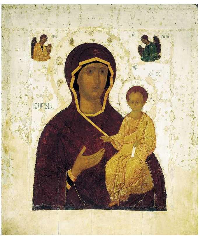
Figure 1. Virgin Hodegetria known as the Virgin of Smolensk.