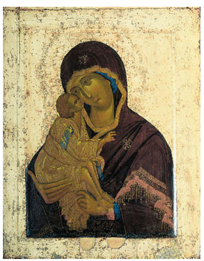
Figure 2. Virgin Eleousa known as Our Lady of the Don. 14<sup>th</sup> Century. Tretyakov Gallery, Moscou.