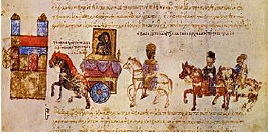
Figure 4: Emperor John 1 Tzimiskes entering Constantinople following an icon of the Virgin (Biblioteca National, Madrid)